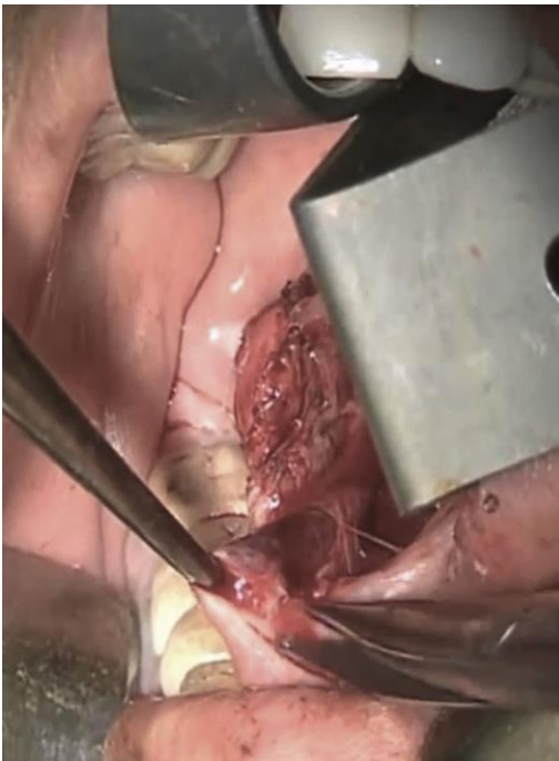
Figure 3 Submandibular Duct Dissection, distal to proximal approach.