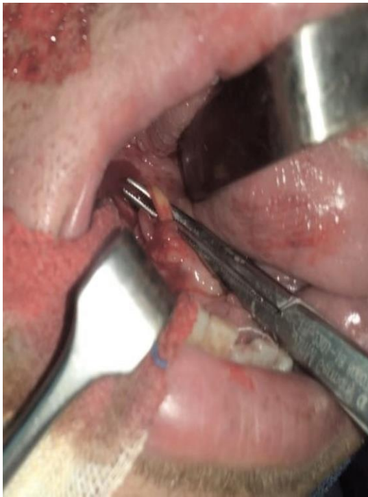
Figure 4 Lingual Nerve medialization after uncrossing with the duct.