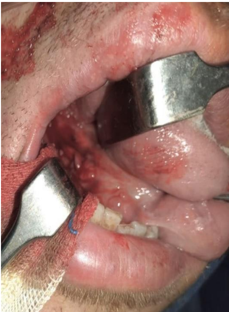
Figure 2 Starting the Mucosal Incision.